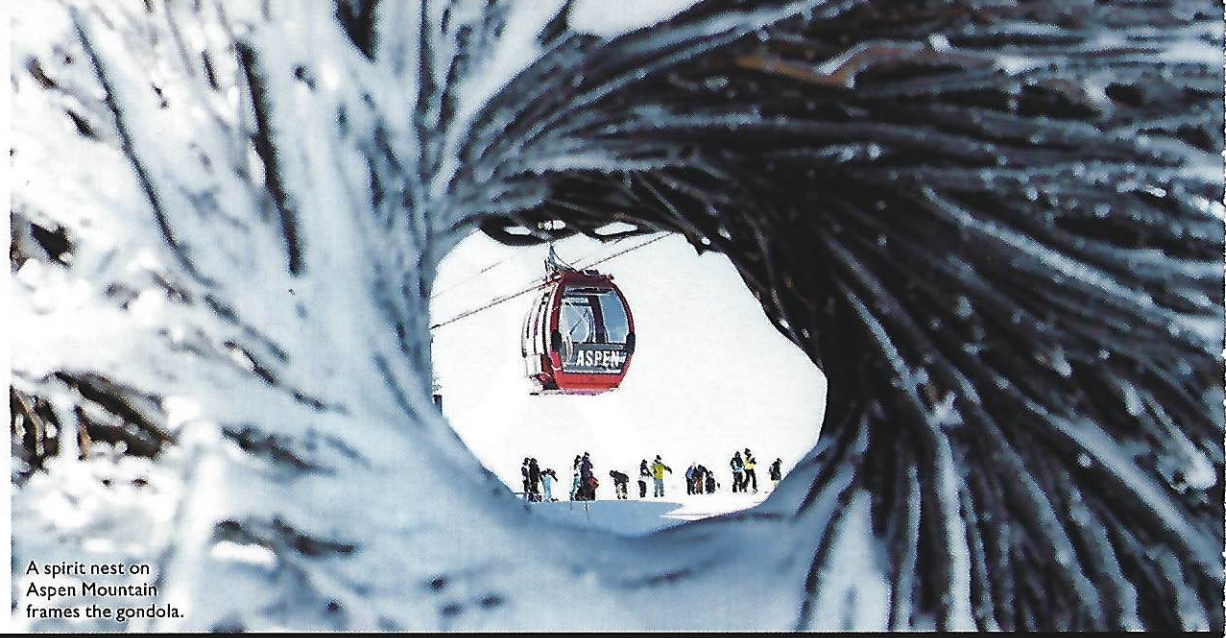
A spirit nest, on Aspen Mountain frames the gondola.